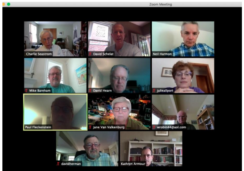
From our recent Zoom Brunch in May